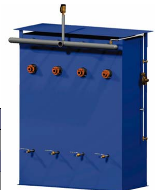
AS - 480